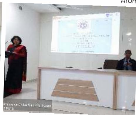
Seminar on Cyber Security