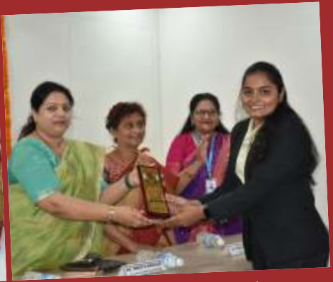
Felicitation of Merit Students