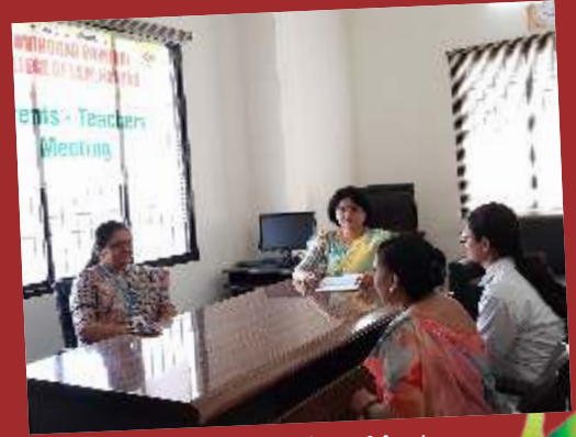
Parent Teachers Meet