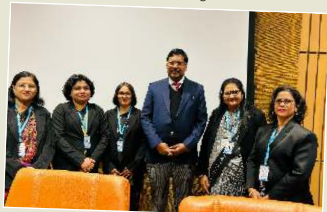
Interaction with Honorable Shri Justice Bhushan Gawai