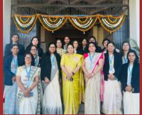
NAAC PEER TEAM VISIT