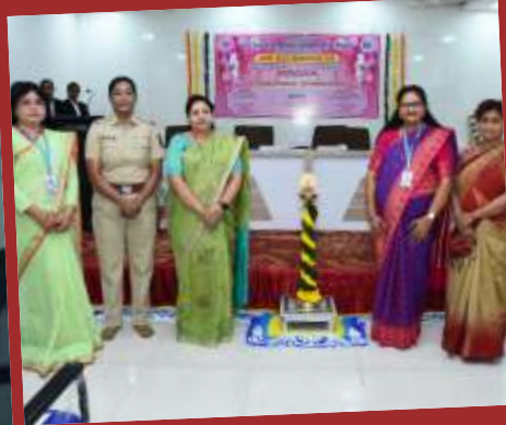
International Womens Day