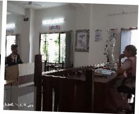
Moot Court Competition