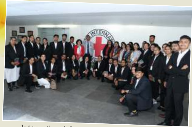
International Committee of the Red Cross