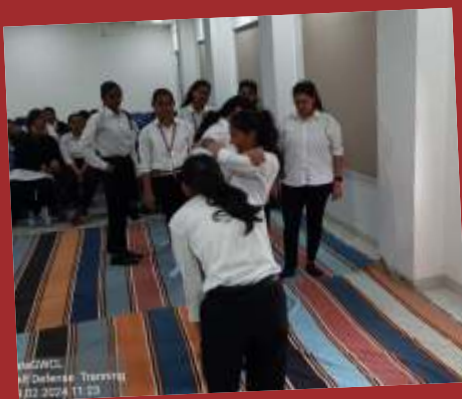
Self Defence Training