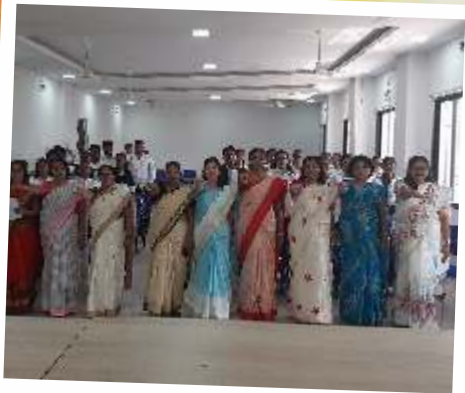
National Unity Day