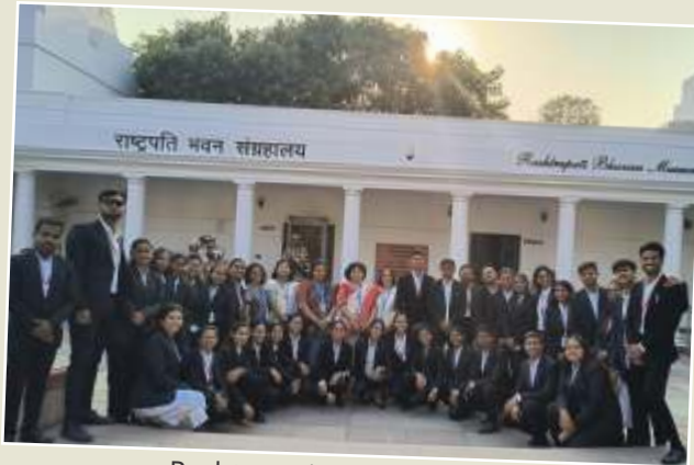
Rashtrapati Bhavan Museum