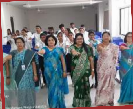
Water Conservation Day