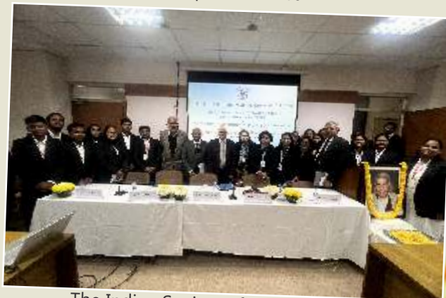
The Indian Society of International Law