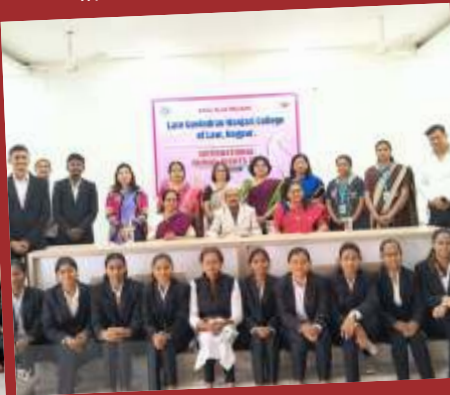
Human Rights Day