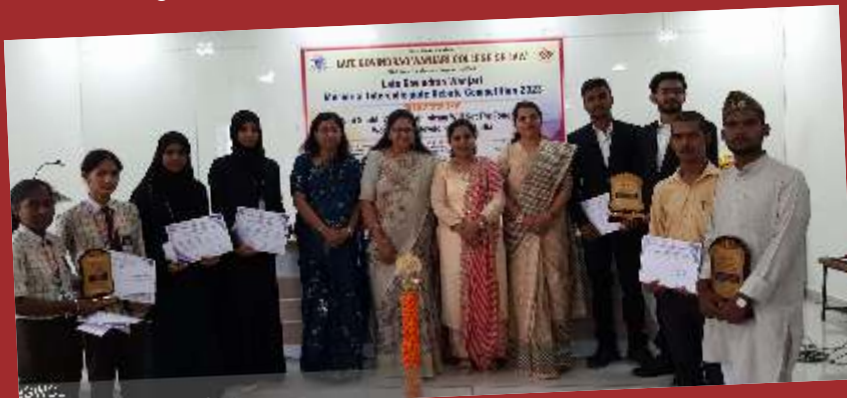
Winners of Debate Competition