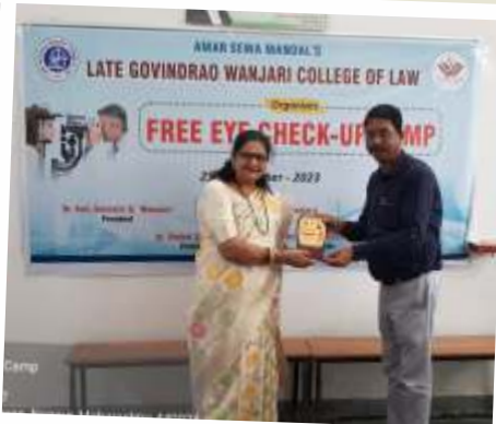
Eye Check up Camp