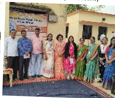
Free Legal Aid Camp