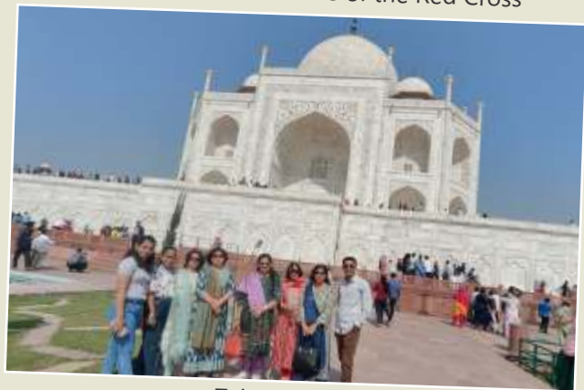
Taj Mahal Agra