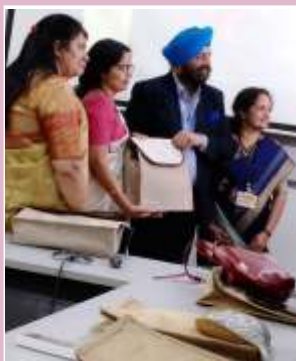
International Committee of the Red Cross (ICRC)