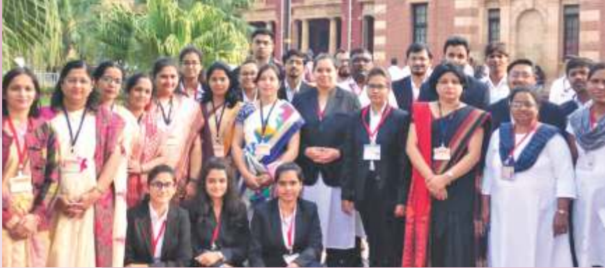
Visit to legislative Assembly - Winter Session, Nagpur