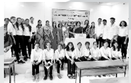
Rakhi for Soldiers