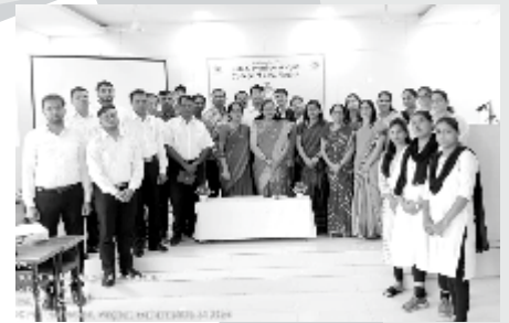
Induction Meeting of LLM Students