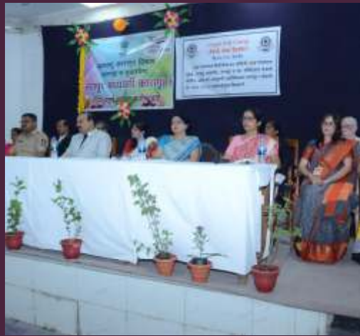
Program in Central Jail