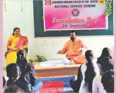
NSS Foundation Day