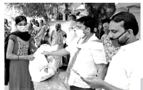
Distribution of food items during Covid