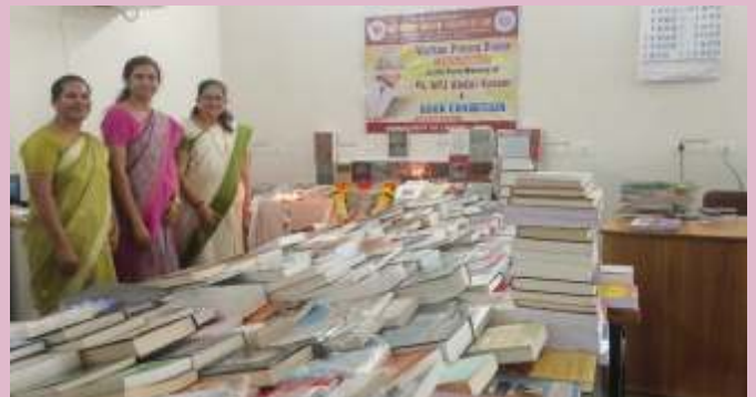
Vachan Prerna Diwas