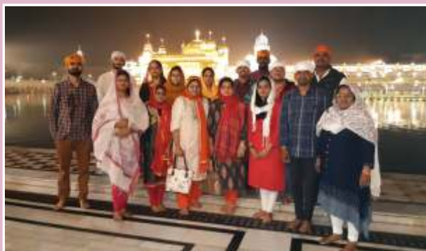
Amritsar - Golden Temple