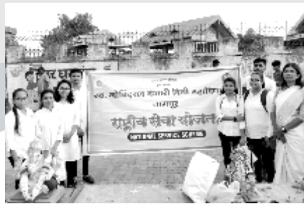
Eco Friendly Immersion of Ganesh Idol