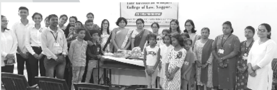
Rakhi Celebration with under privileged children