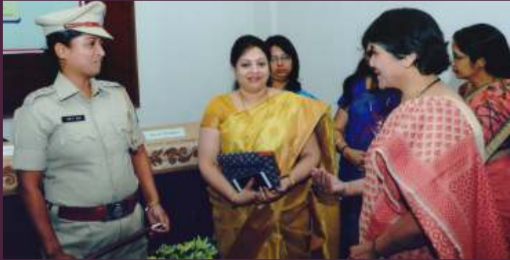
Seminar on Rights of Women