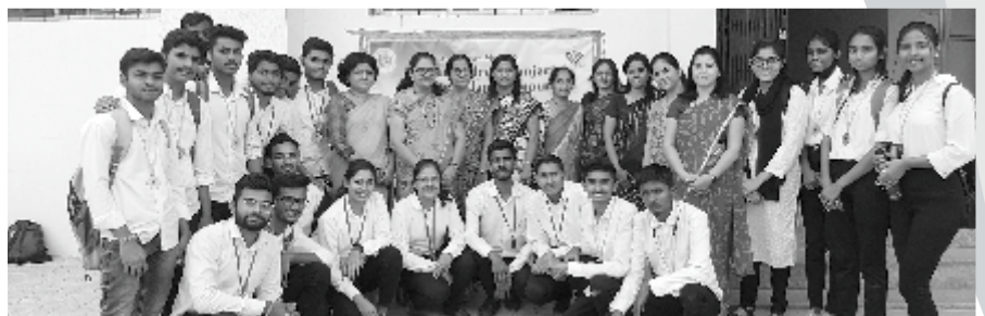
Annual Sports Day