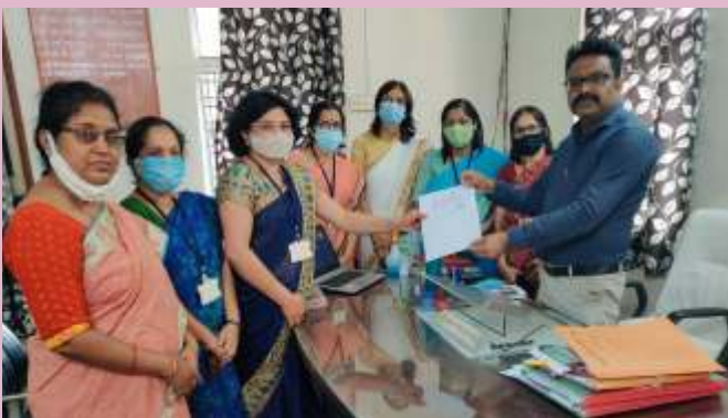
Constitution Day with DLSA