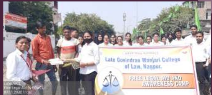
Free Legal Aid & Awareness