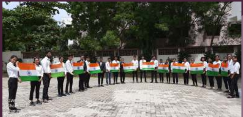
Azhadi ka Amrut Mahotsav