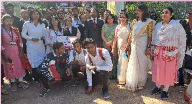
Constitution Day with DLSA