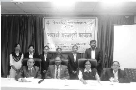
Mediation Program - DLSA