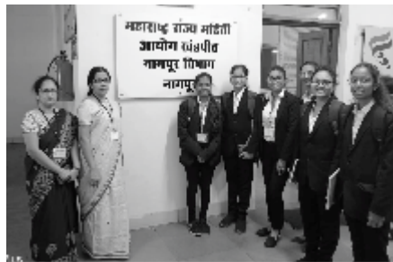
Visit to State Information Tribunal